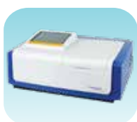
UV/VIS Spectro 2080+ Double Beam

Analytical Technologies is synonymous for offering technologies for doing analysis and is the Fastest Growing Global Brand having presence in at least 96 countries across the global. Analytical Technologies Limited is an ISO:9001 Certified Company engaged in Designing, Manufacturing, Marketing & providing Services for the Analytical, Chromatography, Spectroscopy, Bio Technology, Bio Medical, Clinical Diagnostics, Material Science & General Laboratory Instrumentation. Analytical Technologies, India has across the Country operations with at least 4 Regional Offices, 6 Branch Offices & Service Centers. Distributors & Channel partners worldwide.