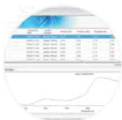
User Friendly Software